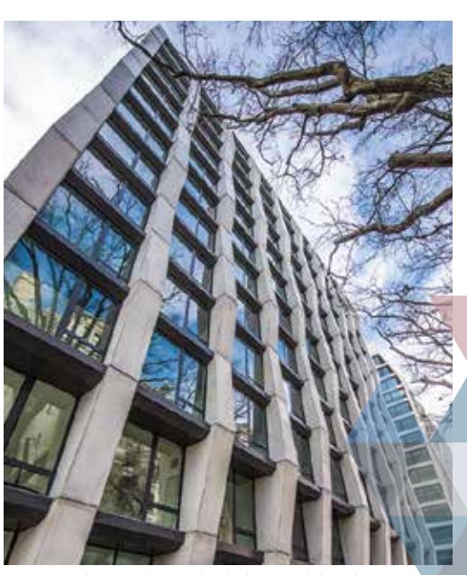
Enclave at the Cathedral Handel Architects