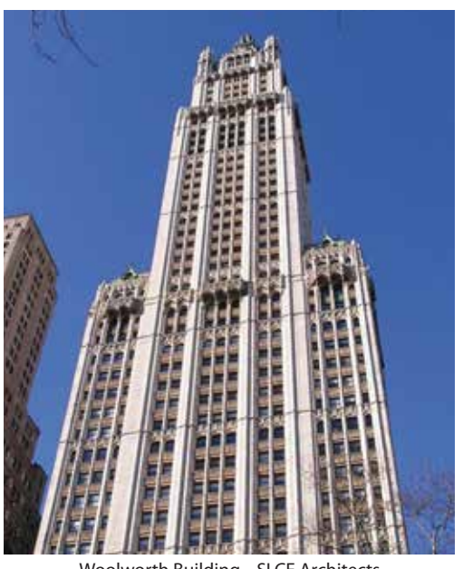
Woolworth Building SLCE Architects