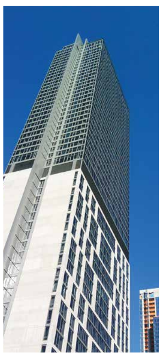
839 6th Avenue Eventi Perkins Eastman