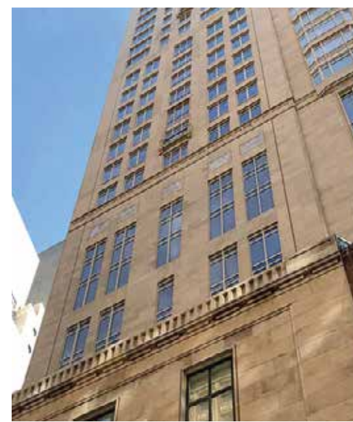
520 Park Avenue RAMSA