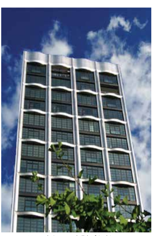
200 11th Avenue Selldorf Architects