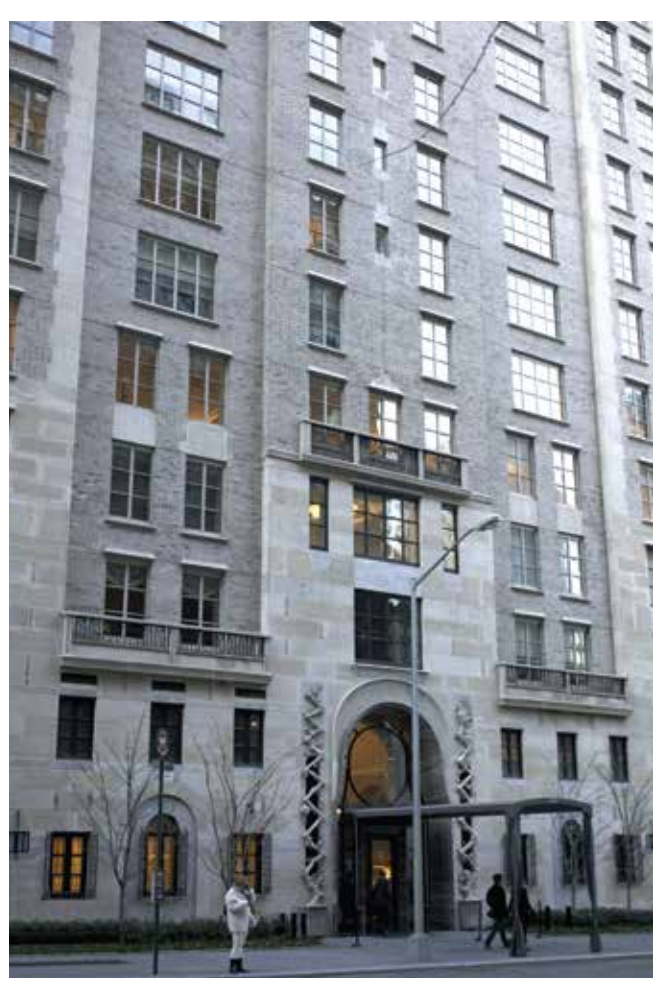
135 East 79th Street Studio Sofield . SLCE

Whether your project calls for standard Advantage by Wausau® products or highly-customized engineered-to-order fenestration, Wausau windows and curtainwall meet institutional market technical challenges for weather-ability, energy efficiency, and blast hazard mitigation. Custom capabilities are backed by more than 1,000 years of combined design experience, as well as in-house structural engineering and a modern, LEED-Silver certified manufacturing facility.