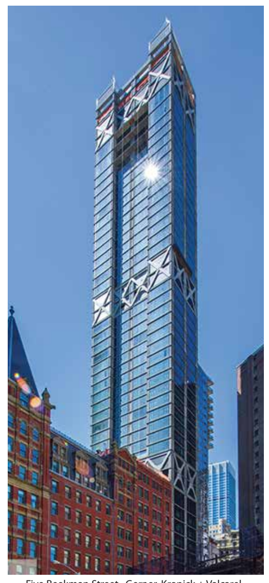
Five Beekman Street \,\, Gerner, Kronick + Valcarel