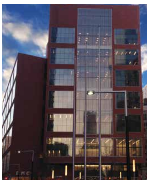
Fiterman Hall Pei Cobb Freed & Partners